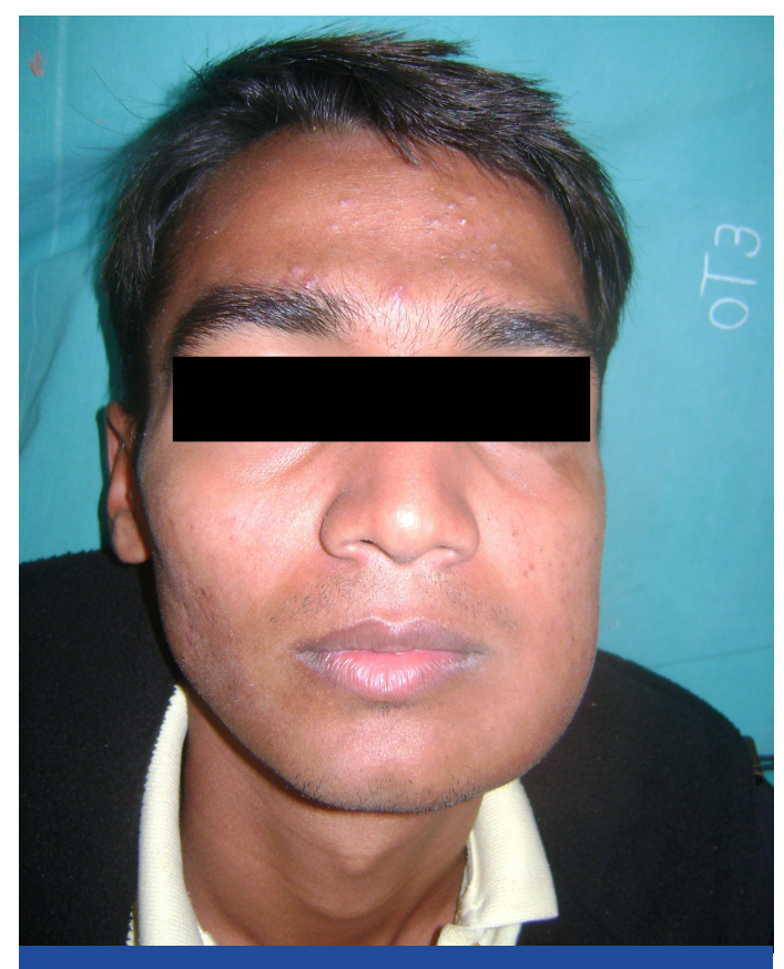
[Table/Fig-1]: Extra-oral view

After obtaining consent from both the patient and the physician, resection of the tumour and reconstruction was planned under general anaesthesia. An intraoral incision was made from the lower left incisor region to the distal part of the lower left third molar