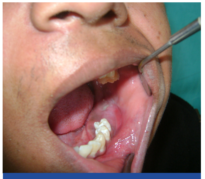
[Table/Fig-2]: Intra-oral view